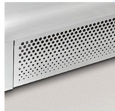
Griglia vano motore estraibile