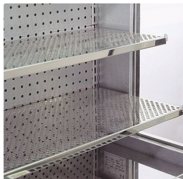
Ripiani in acciaio inox regolabili